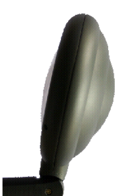
TYPE M KINGFISHER AURIGA