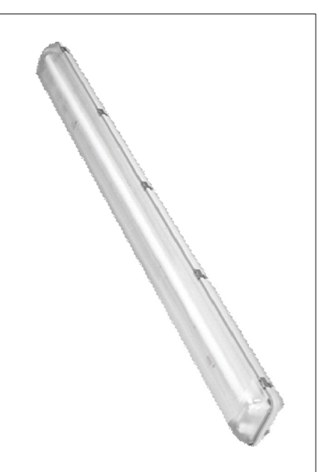
TYPES F & H GLAMOX 140

LUMINAIRE IMAGES - SEE LUMINAIRE SCHEDULE WITHIN SPECIFICATION FOR FURTHER DETAILS